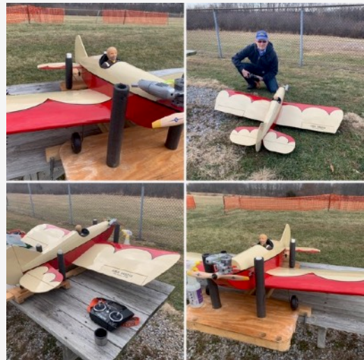
This is a Great Planes kit with an O.S. Max 46AX II turning a 11 X 7 prop. Multiplex Cockpit SX 9 transmitter and Futaba S3151 servos. True to its name, it can fly slow!